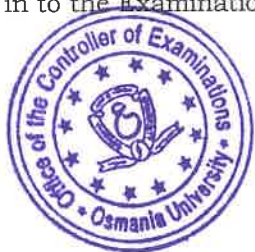
CONTROLLER OF EXAMINATIONS